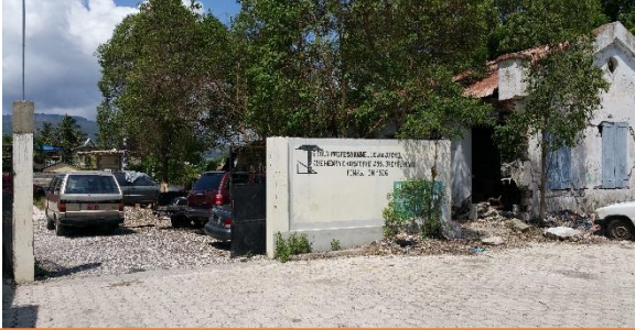
Current EPJ's Building