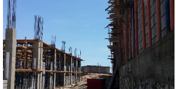
New EPJ's Building Under Construction